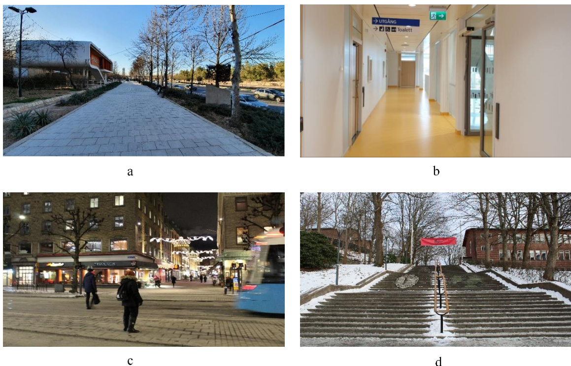
Figure 3. Examples of real-world environments (a and b) and real-world + environments (c and d).

Physical environments are also defined in the safety protocol. The test bench is where the prosthesis can be mounted and tested, disconnected from the participant. The mounting and placement of the prosthesis should be done in a manner by which the safety of the research staff is ensured, preferably inside a cage or in an otherwise shielded-off environment. Laboratory environments include ambulation on a treadmill or in a small circuit in a clinical laboratory room, with minimal distractions and even surfaces. Outside lab environments are separated into “real-world” and “real-world +” environments where the latter is defined as environments which are challenging to navigate with a lower limb prosthesis, for example due to uneven terrain, slippery surfaces, or crowds. Examples of real-world and real-world + environments are shown in Fig. 3.