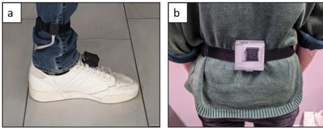
Figure 1: a) INDIP foot positioning (MIMU, PI, DS); b) INDIP lower back positioning.

instep using a clip. The DSs were attached asymmetrically, pointing medially, with elastic belts to the shanks to avoid mutual interference (Fig. 1). A total of 12 markers were used: four markers on each foot, and four markers placed on a rigid cluster used as support also for the lower back IMU. For the free-living acquisition, participants were equipped with the INDIP system only (Fig. 1).